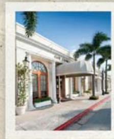
An array of shopping and dining choices nearby