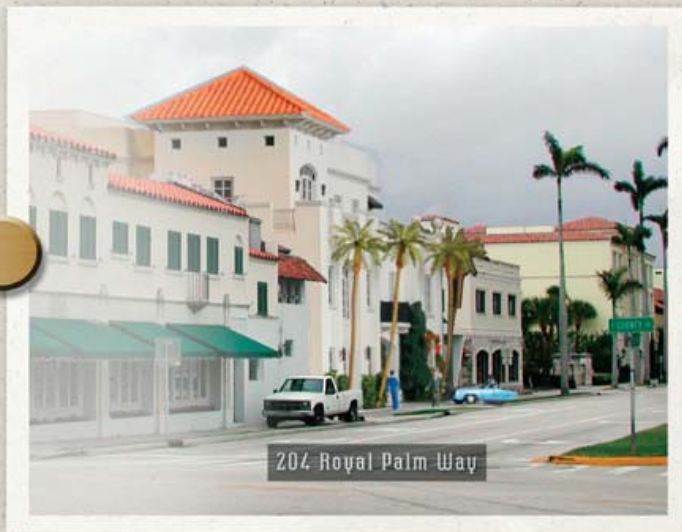
204 Royal Palm Way