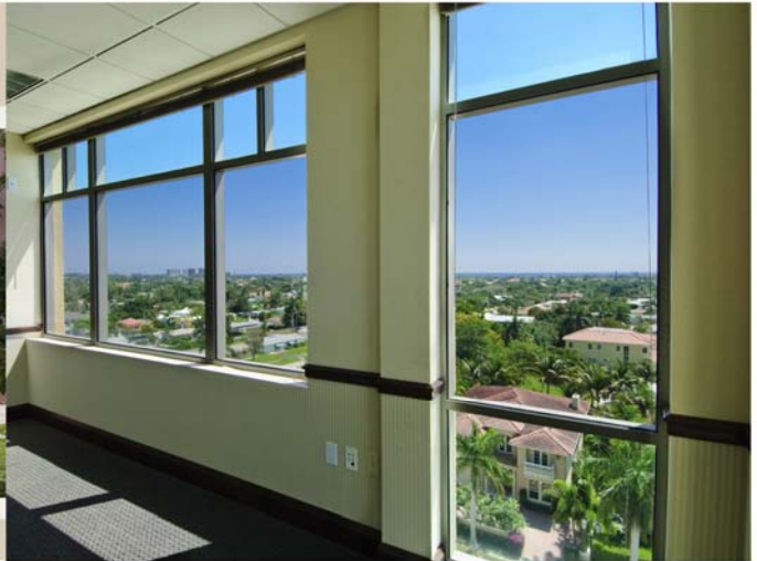
View from Tower Office Suite

Mizner Park Office Tower accommodates companies of all sizes. Representative suites only are shown here.